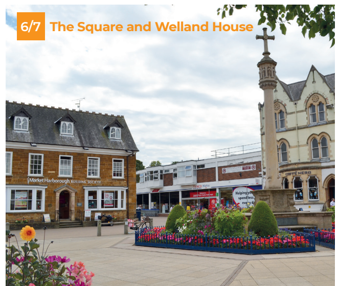
6/7 The Square and Welland House

When you reach the footbridge on your right, cross over and enter the Memorial Gardens, through a gate to your right. The gardens were built in 1954 as part of the town's commemoration of the Second World War. The grand blue gates are from Gopsall Hall, which was demolished in 1951.