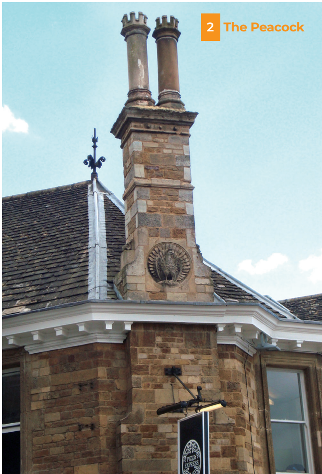
2 The Peacock

Follow the precinct until you reach the car park (near Sainsbury's).