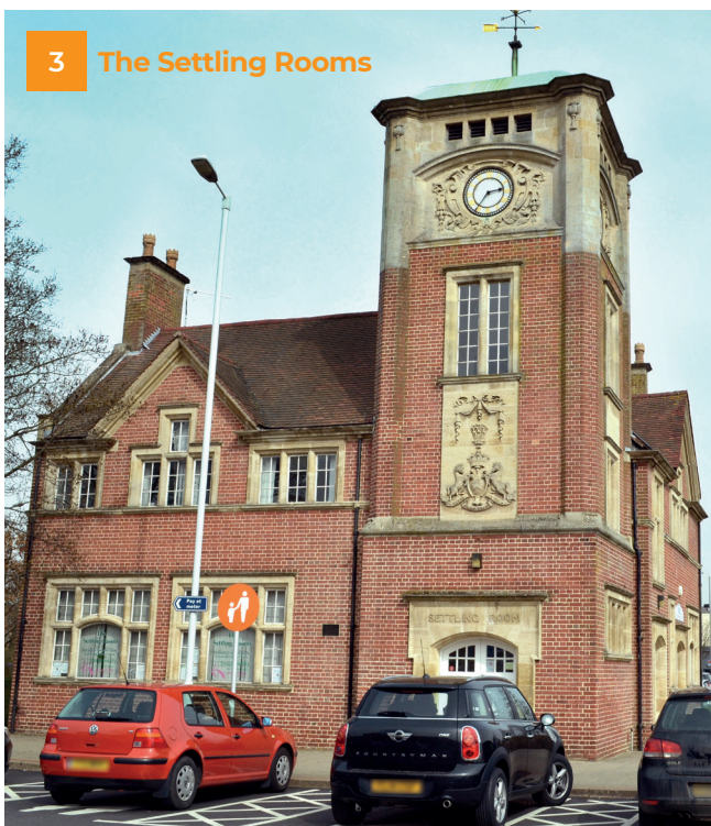
3 The Settling Rooms

3 The Settling Rooms - Towards the middle of the car park is a red brick building called the 'Settling Rooms'. This whole area was once the cattle market where livestock was brought to be sold to farmers, dealers