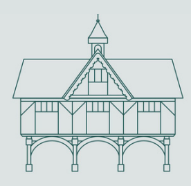
Old Grammar School