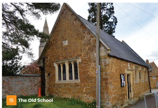
15 The Old School